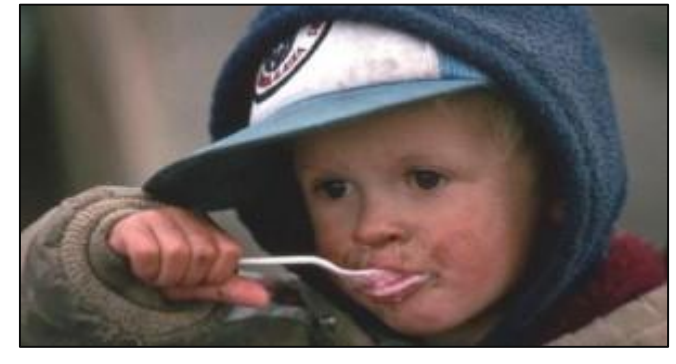
Do we know how many kids go hungry every day? I don't have the figure with me right now

If the world was just the way God wanted it to be, what do you think would be different than it is right now? No hatred. Bingo. Imagine what it would be like to have a new world where we didn't have to other people, and we didn't have to fear other people's hate. What would the world be like if it was the world that God envisioned for us? There wouldn't be anyone going hungry.