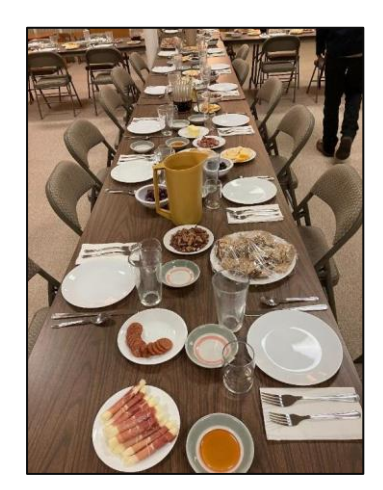
The meal was set