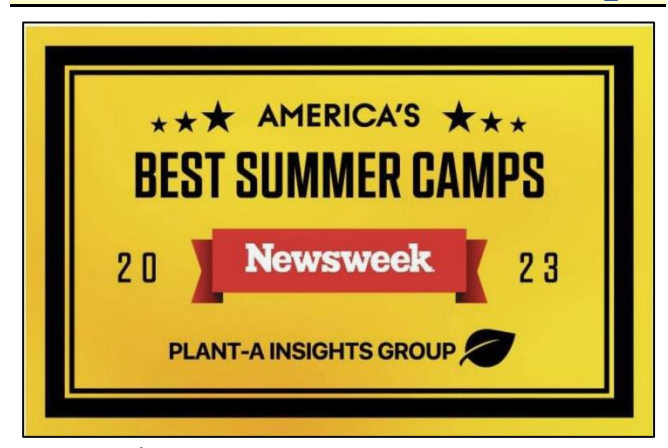
page 7 of 11

This year, Camp Magruder is listed in Newsweek as one of the top camps in America – one of only four listed from Oregon! We are partial of course, but happy to see it!